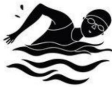
(go, swim, family)