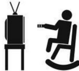
(watch, television, evening)