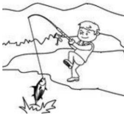
(catch, fish, hobby)