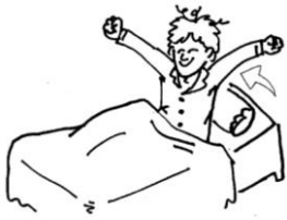
(get up, morning)

03. The following pictures show what Sehas does on weekdays. Write a sentence about each picture. Use the words given below the picture. Each sentence must have at least five words. The first one is done for you.