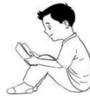
(read, books, sister)