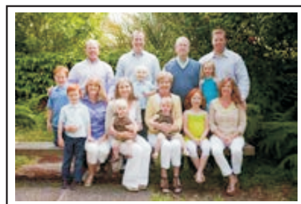
B - .....