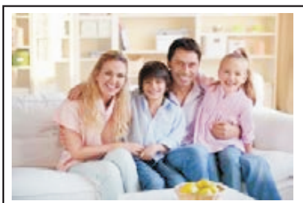
A - .....