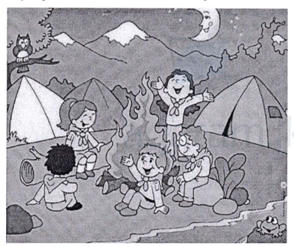
Test 4 Study the picture. Fill in the blanks with the words given in the box.