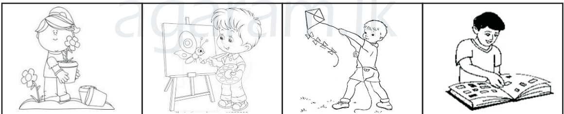
1 2 3 4

Test - 11 Match the picture with the name and write the correct number in the space given below.